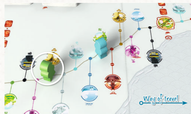
The Green traveler is farthest behind on the road, so he starts.

Sometimes the last Traveler may still be last after moving, in which case he goes again immediately.