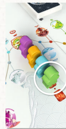
The green traveler will be the first one to leave the Inn.

The first traveler occupies the space nearest the road, and later travelers form a line after him.