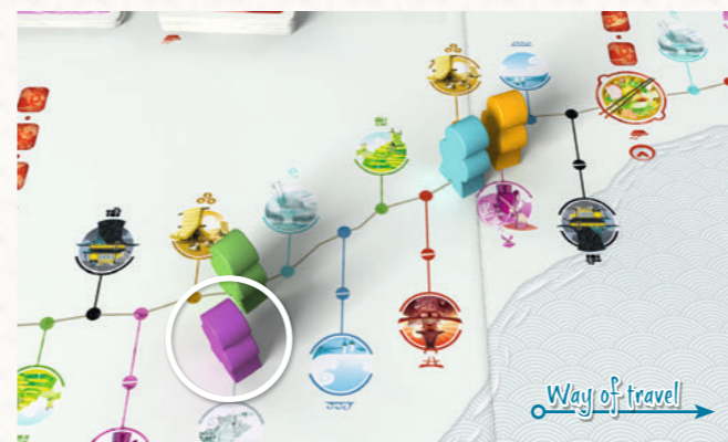
The Purple traveler is farther behind than the Green traveler, therefore he starts.