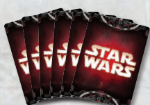
Dark Side Player #1