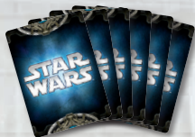
Light Side Player #2