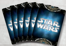
Light Side Player #1

A player may only declare engagements against the player sitting across from him. Players may interact with and influence the other playing field using card effects and when resolving tactics icons. Additionally, new rules such as the common reserve, support attack, support defense, and a common Force struggle enable partners to work together a variety of ways during a game.