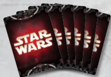
Dark Side Player #2