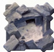
10 Troll Lairs