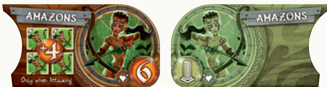
Amazons, Active and In Decline