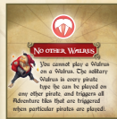
Adventures in play

Each player receives 8 cards. They make up his Hand.