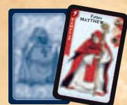
24 Suspect cards