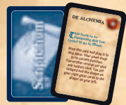
24 Scriptorium book cards