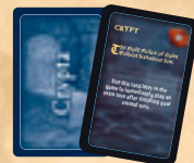
6 Crypt cards