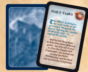
18 Event cards