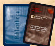
8 Library book cards