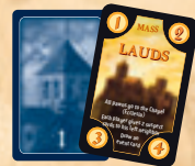
8 Mass cards