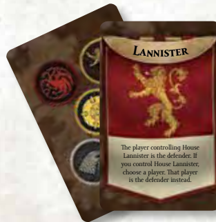
18 EVENT CARDS (3 PER HOUSE, 3 SPECIAL)