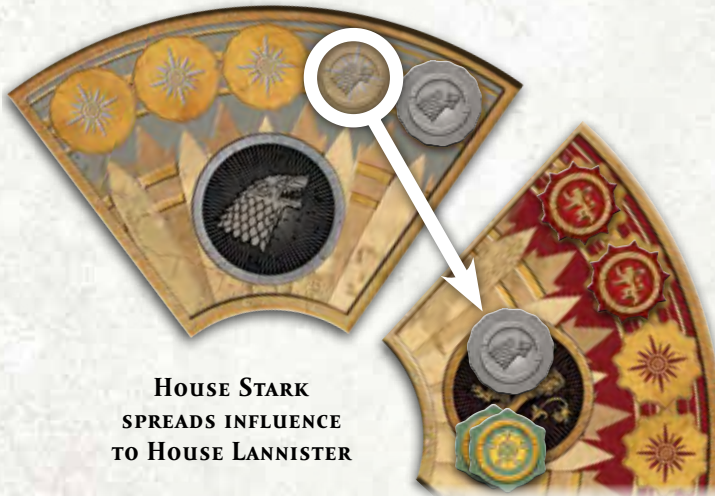
HOUSE STARK SPREADS INFLUENCE TO HOUSE LANNISTER

Players win the game by spreading influence to the other houses. Each time a player spreads their influence, they remove one of their own tokens from their own board, placing it on the board of the player to whom influence is being spread.