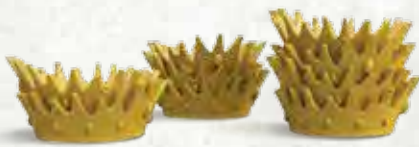
100 PLASTIC POWER MARKERS