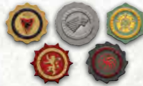
25 INFLUENCE TOKENS (5 PER HOUSE)