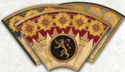
5 INFLUENCE BOARDS (1 PER HOUSE)