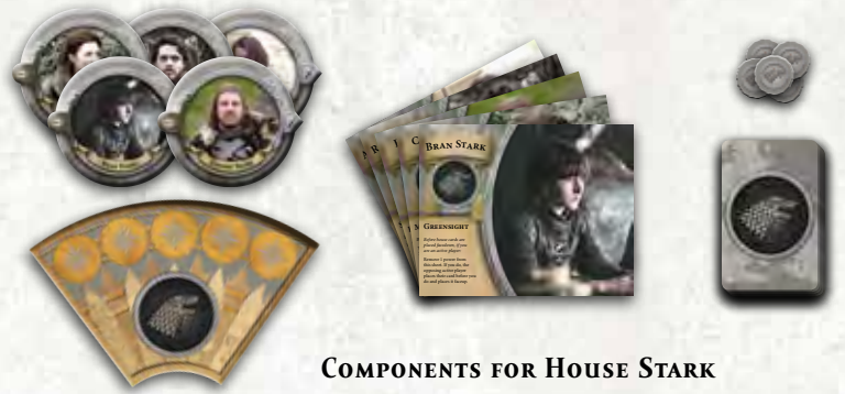
COMPONENTS FOR HOUSE STARK

Choose Houses: Each player chooses one of the available Great Houses—Lannister, Stark, Baratheon, Targaryen, or Tyrell—and collects all components related to that house. This includes five character tokens, one influence board, five leader sheets, five influence tokens, and a house deck of 25 cards. The components for each house are marked with that house's sigil or colors.