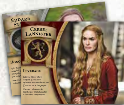
25 LEADER SHEETS (5 PER HOUSE)