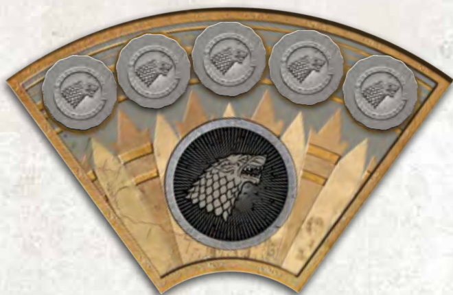
INFLUENCE BOARD WITH 5 INFLUENCE TOKENS

During the game, the goal for players is to spread influence to the other houses. This is accomplished primarily by winning encounters (see "Turn Overview" to the right), and the first player to spread all five of their influence tokens wins the game .