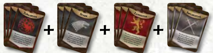
3-PLAYER GAME WITH HOUSE TARGARYEN, HOUSE STARK, AND HOUSE LANNISTER