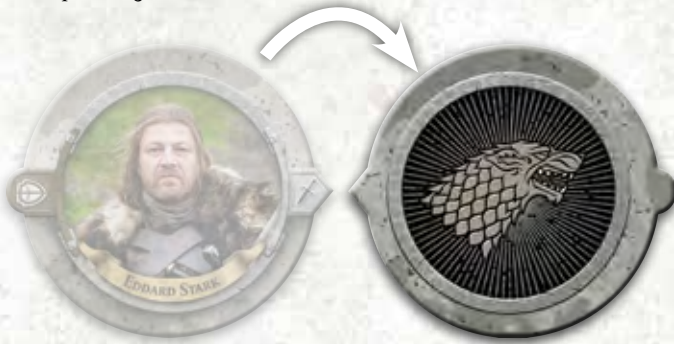
EDDARD STARK IS KILLED AND FLIPPED FACEDOWN

When a character dies, the character token is flipped facedown. The character can no longer participate in encounters, and cards corresponding to that character cannot be used for their text effect.