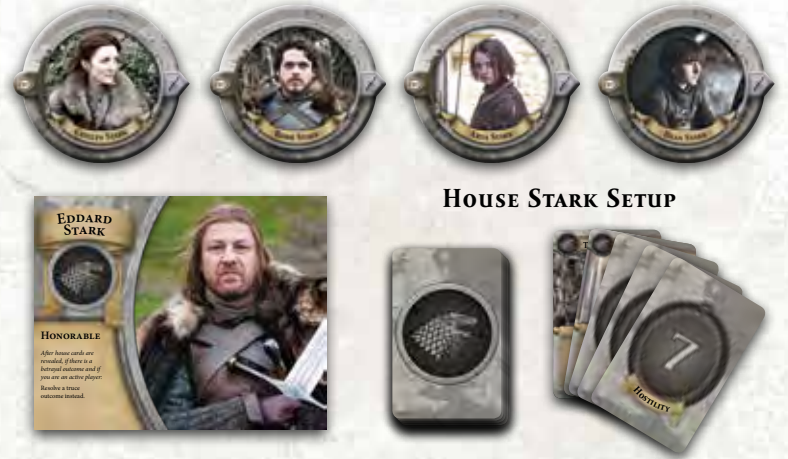
HOUSE STARK SETUP

Finally, each player draws a starting hand of five cards from their house deck.