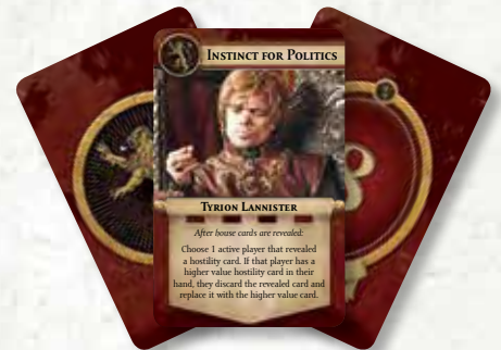
125 HOUSE CARDS (25 PER HOUSE)