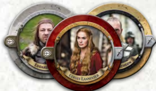
25 CHARACTER TOKENS (5 PER HOUSE)