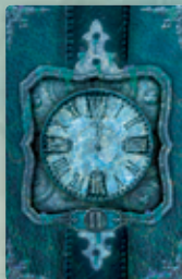
Stage II Mythos Card Back

When players draw and resolve a new Staged Mythos card, they are presented with a dilemma and must choose as a group between one of the two options listed on the card. Players may choose either option. If players cannot decide as a group, the investigator who took the last turn chooses an option.