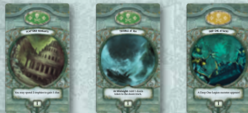
3 FACEDOWN PACIFIC ADVENTURE CARDS