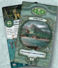
60 PACIFIC ADVENTURE CARDS