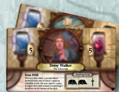
8 INVESTIGATOR CARDS