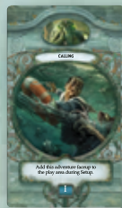
Special Adventure Card

In Omens of the Deep , Special Adventure cards are used by investigators to move the expedition further into the open sea toward the mysterious calling.