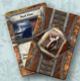
3 ALLY CARDS