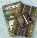
3 COMMON ITEM CARDS