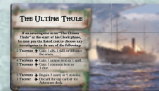
1 "THE ULTIMA THULE" ENTRANCE CARD