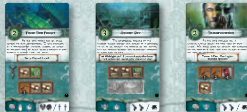
3 FACEUP PACIFIC ADVENTURE CARDS