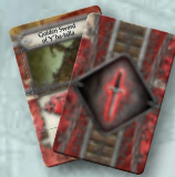
3 UNIQUE ITEM CARDS