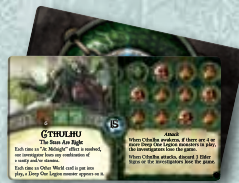
3 ANCIENT ONE CARDS