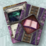
3 SPELL CARDS