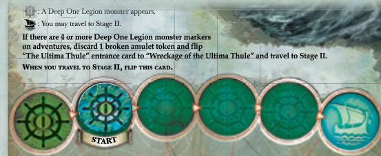
Dark Waters track with the omen token in the starting position.

If the omen token would retreat, but the token is already on the leftmost space of the track, resolve the corresponding effect for that space.