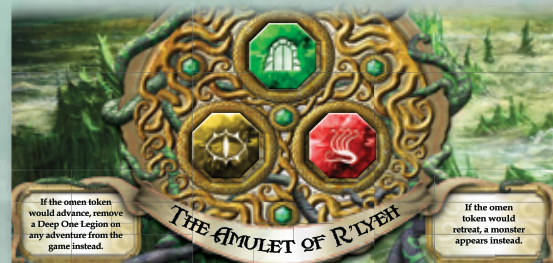
Amulet of R'lyeh track with all 3 broken amulet tokens.

If the omen token would advance or retreat when investigators are in Stage II, resolve the corresponding effect as listed on the Amulet of R'lyeh track.