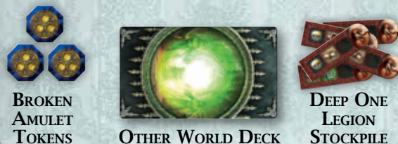
BROKEN AMULET TOKENS OTHER WORLD DECK DEEP ONE LEGION STOCKPILE