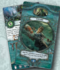
4 SPECIAL ADVENTURE CARDS