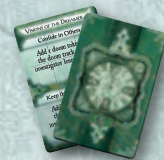
40 STAGED MYTHOS CARDS