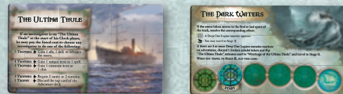
“THE ULTIMA THULE” ENTRANCE CARD SCENARIO CARD