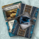
12 SKILL CARDS