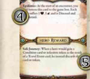
ADVANCED QUEST CARD FRONT