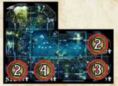
Secret Room S2A