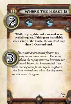
ADVANCED QUEST CARD FRONT