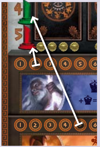
Red played first: once he is done performing actions, he places his offering marker on the 5 space. The next player (Green) will place his marker on the 4 space, etc. Thus, it is the player who played

last who will, during the next turn, make the first offering.