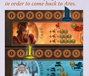
And that's exactly what happens: Yellow makes an offering worth 3 to Poseidon, ousting Blue.

Blue immediately makes an offering worth 7 to Ares, ousting Red, who must now make an offering to another God... What will Red do?