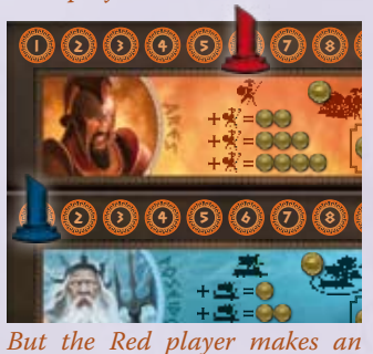
offering worth 6 on Ares! The Blue player must immediately make a new choice. He then makes an offering worth 1 to Poseidon, hoping to be ousted