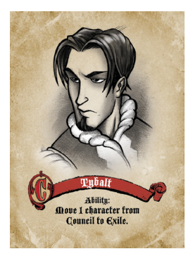
Example "Tybalt" Action may be taken when the card is played.