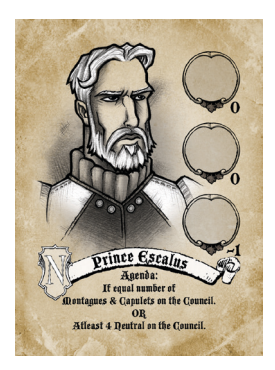
Example "Prince Escalus" Influence markers are placed on the "Influence" areas and count as points if the Agenda condition is met.

NOTE: It is advisable to select at least one Influence card.