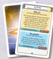
30 FLARE CARDS