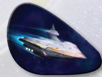
1 CRUISE LINER TOKEN