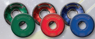
8 SHIP MARKERS