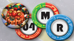
9 JOKER TOKENS