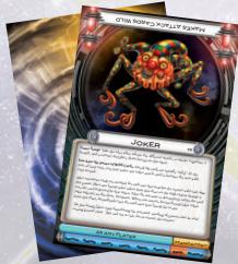
30 ALIEN SHEETS