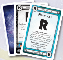
32 REWARD CARDS