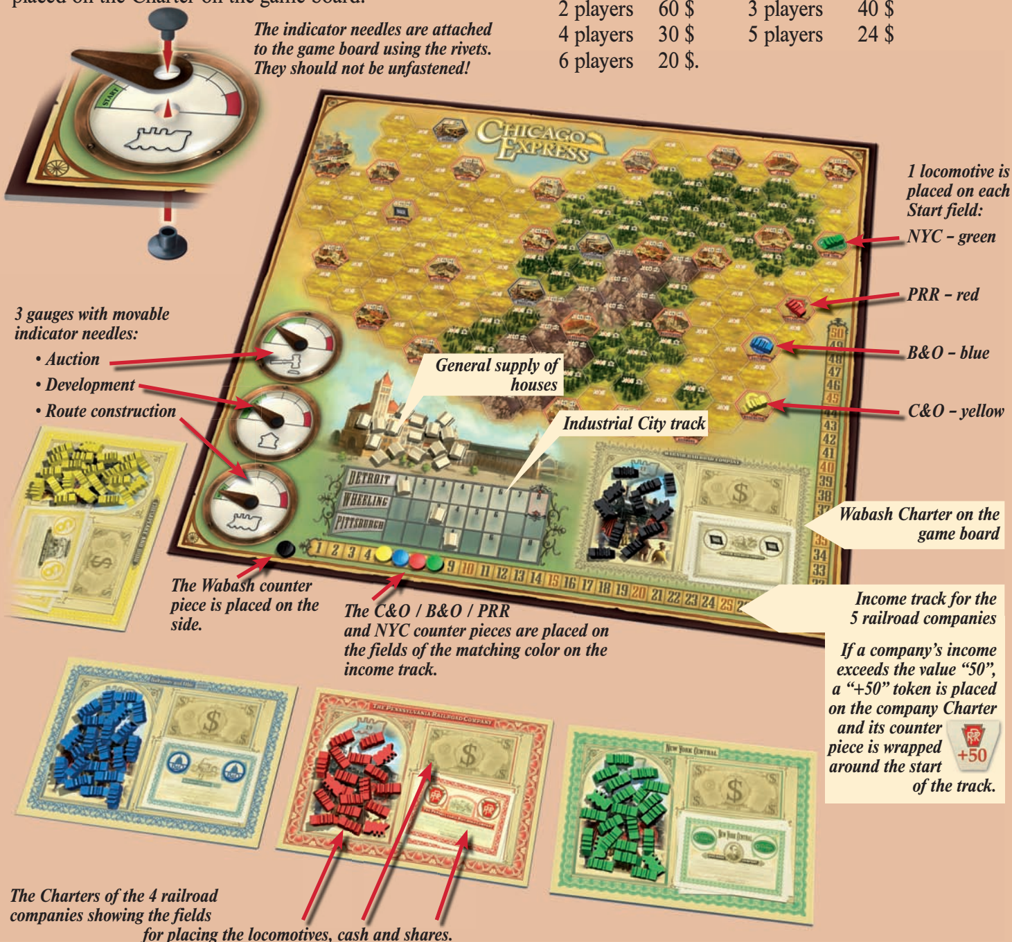
The indicator needles are attached to the game board using the rivets. They should not be unfastened!