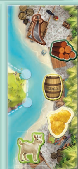
Marketplace: one of each tile.