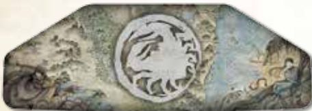
7 DAIMYŌ SCREENS