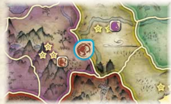
Scorpion attacks Unicorn by placing an army token on an adjacent land border.

To attack, a player can place an army token on a land border between a province they control and an adjacent province they wish to attack. To defend, a player can place an army token in any province (landlocked or coastal) they control.