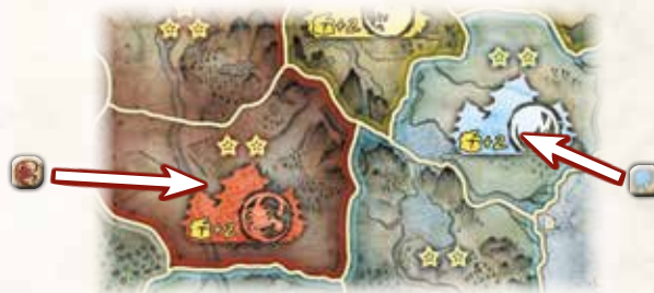
Scorpion and Crane place control tokens in the provinces containing their respective clan capitals.