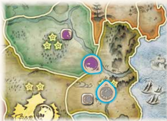
Unicorn attacks Crab. Crab defends his province by placing a combat token in its center.

To bluff, a player can place this token as if it were any non-blessing combat token. Placing a bluff token is also how a player saves a valuable combat token for the next round since players place all but one of their combat tokens that are behind their screens. Discarded bluff tokens are always returned to their owners' hands.