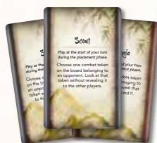
Scout and Shugenja Cards