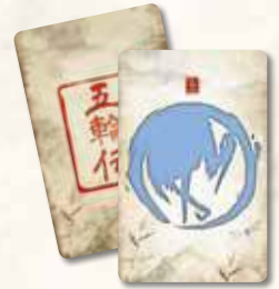
10 INITIATIVE CARDS