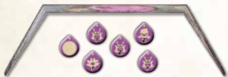
Example of a player's hand of combat tokens after step 2 of the upkeep phase.