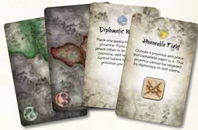
22 TERRITORY CARDS (2 PER TERRITORY)