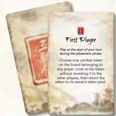
1 FIRST PLAYER CARD