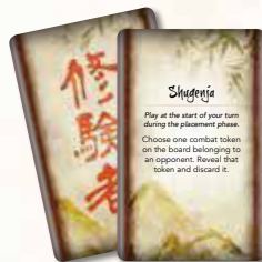
5 SHUGENJA CARDS