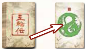
Dragon is now the first player.