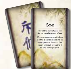
10 SCOUT CARDS