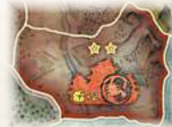
This province contains the Scorpion clan capital.

Each clan has a CAPITAL that is represented by a castle icon on the map. At the beginning of the game, each clan controls the province where its clan capital is located.