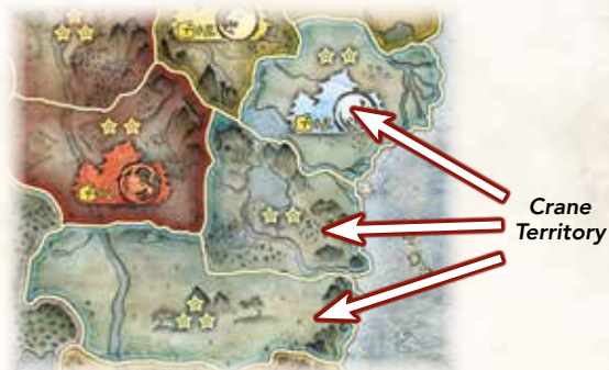
The Crane territory comprises the three indicated provinces.

A territory is a grouping of multiple provinces. All of the provinces that make up a territory are the same color.