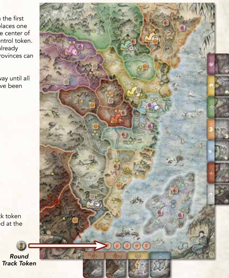
A four-player game between Crab, Phoenix, Scorpion, and Unicorn after setup.