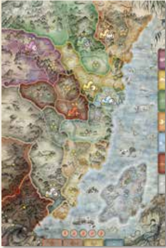
1 GAME BOARD