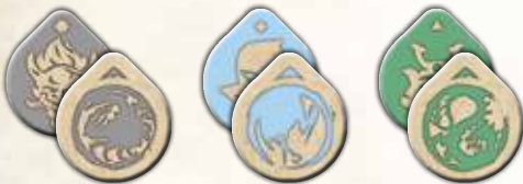
189 COMBAT TOKENS (27 PER CLAN)