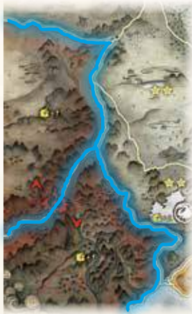
The Shadowlands contains two single-province territories, both highlighted here in blue.

The Shadowlands do not provide players with honor at the end of the game. A player does not gain honor for controlling Shadowlands territories or for having faceup control tokens in either Shadowlands province.