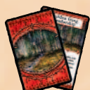
Sheldon Gang Membership

The new Special cards include Sheldon Gang Memberships , which may be acquired at the Woods; Rail Passes , which can be acquired at the Train Station; and four Condition cards , which are explained in full on page 6.